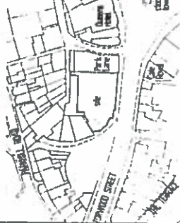
site location plan

You must contact the Building Control Officer at the Council Offices in this office before further work is carried out. Structural conditions, calculations, details of stability and support must be provided as necessary by a Civil and/or Structural Engineer. Advance site investigations must take place before any work commences to ensure that the Contractor is fully aware of all site conditions. To include, as necessary, trial bays for foundations, underpinning etc. DO NOT SIGN THESE DRAWINGS UNLESS YOU ARE SURE YOU MUST ASK BEFORE PROCEEDING FURTHER!!